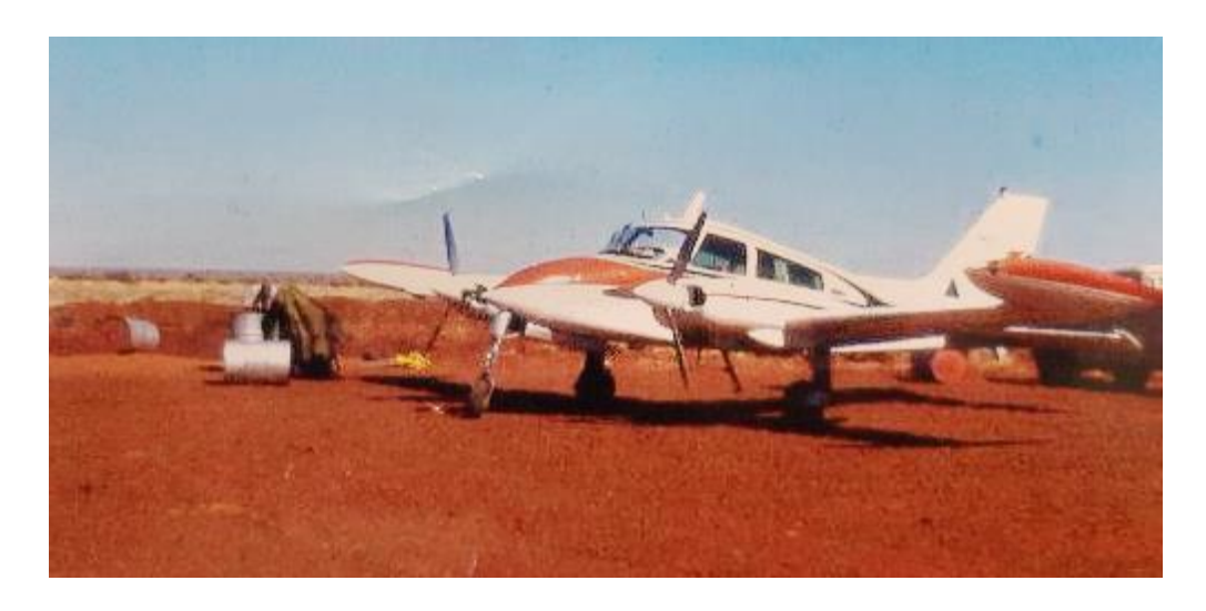
"Tower, What's the definition of instantaneous?"

I was on duty in Perth Tower at 2am one cold winter's morning positioning Speedbird 10, a British Airways 747 down the coast for landing on the northern runway. A blinding flash of lightning to the west close to Speedbird prompted me to ask him "operations normal?". After a long pause he replied "affirmative", quickly followed by his question about the definition of instantaneous. I replied, "I'll bite, what is it?".