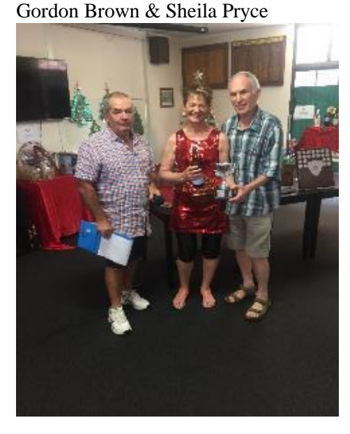
Champion Pair: Saturday Afternoon